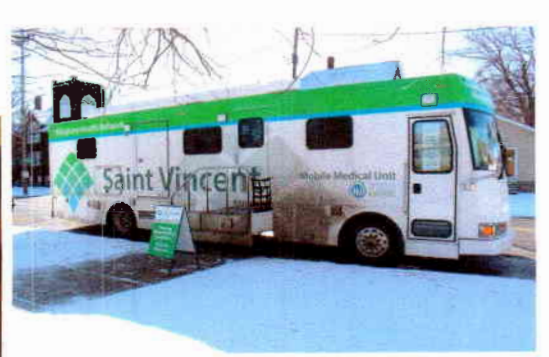
The St. Vincent Mobile Unit Visits the Pantry by-weekly